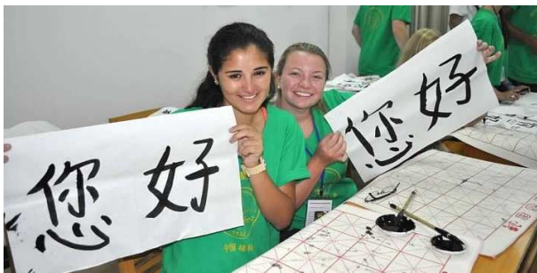
At Rutgers University in New Jersey, USA